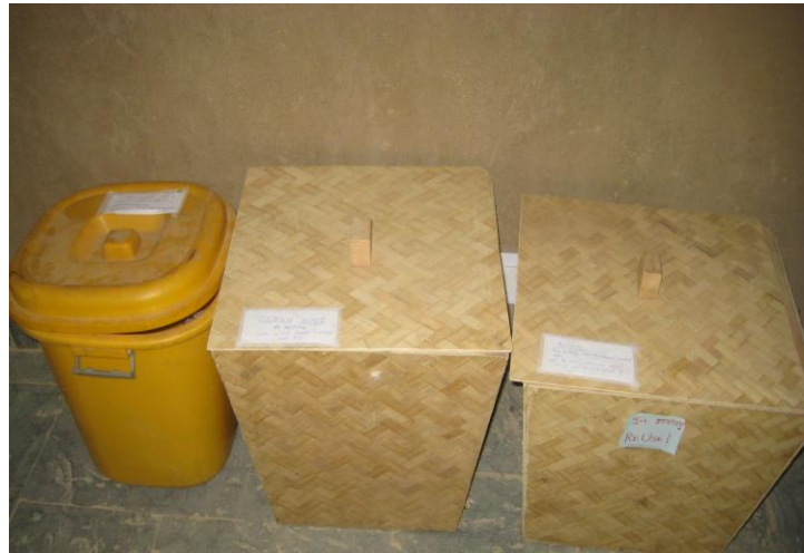
Before the Nayi Dishayein workshop a system was put in place to sort waste and participants were asked to take back their plastic waste as far as possible

Here is what he says, "At Sambhaavnaa, we aspire to minimize our contribution to the waste crisis in a number of ways, with an aim towards being a Zero Waste institute, by applying the "5-Rs": Rethink, Refuse, Reduce, Reuse, Recycle", in that order. In other words, we will prioritize the prevention and avoidance of waste first, and only look at 'management' of it afterwards, since 'management' is today so often a euphemism for "dumping on someone or someplace else."