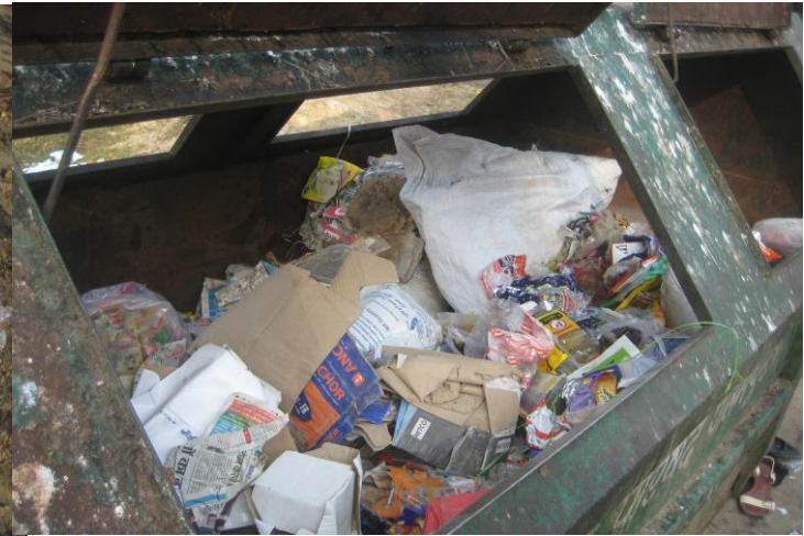
A trip was made to the local kabadiwala to drop the plastic bottles and other waste. Paper was given to the paper recycling unit at Mcleodganj