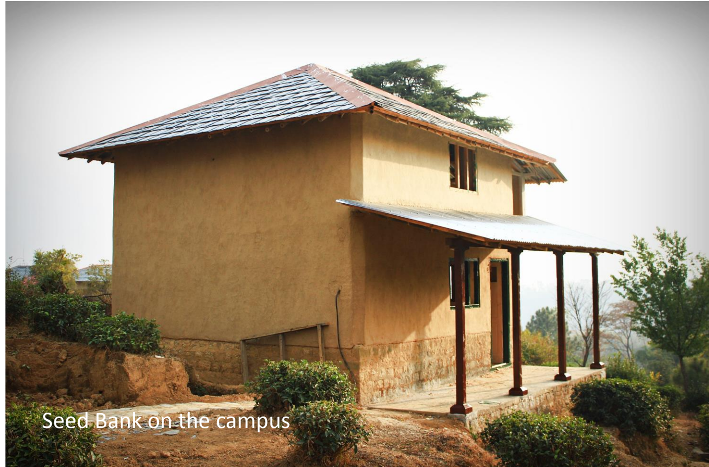
Seed Bank on the campus