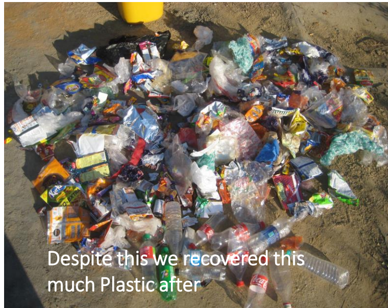
Despite this we recovered this much Plastic after